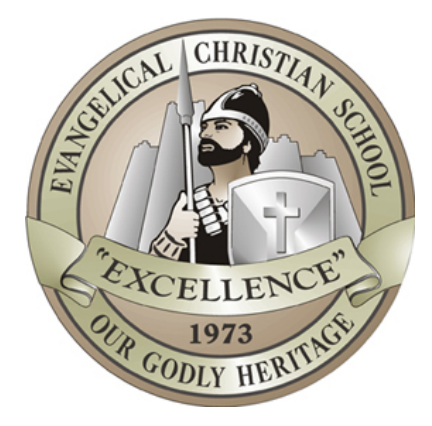
Letter of Welcome