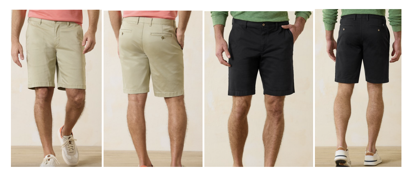
NOT ALLOWED - No Cargo Shorts. No Elastic Waistband. No Short Shorts (shorts must fall to knee or just above the knee). No underwear hanging out underneath the bottom of shorts. ↓ Inappropriate Shorts - Not Permitted