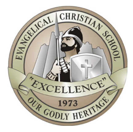
Letter of Welcome